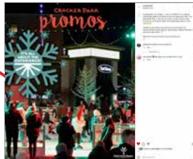
Printed & promoted on socials