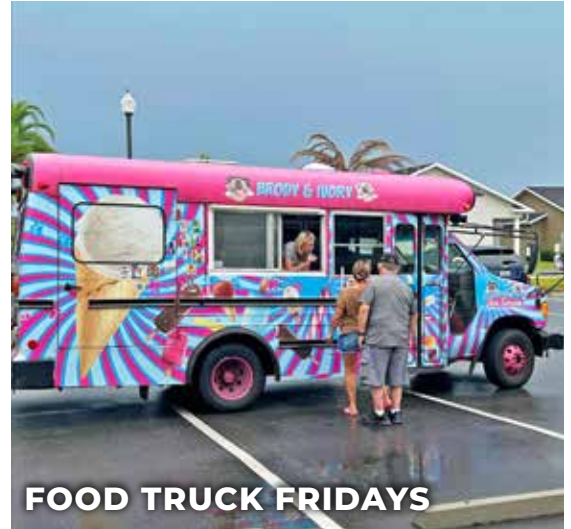
FOOD TRUCK FRIDAYS